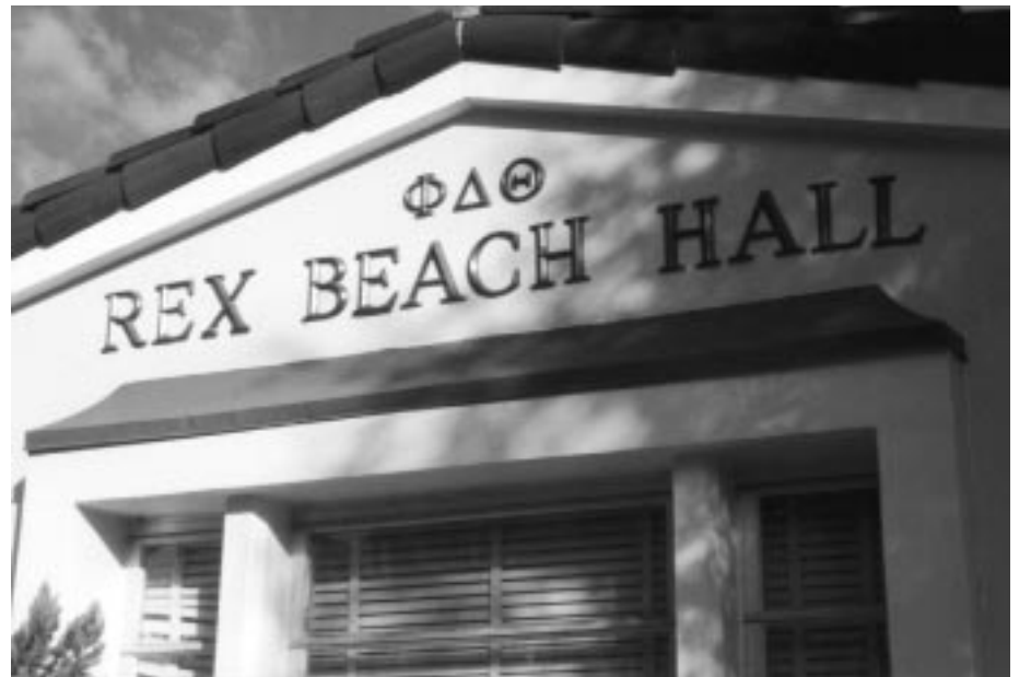
Some of the sights one of the back lots at MGM Studios in Orlando.

check out new york beta/phi delta theta on the world wide web: http://www.vu.union.edu/~phidelt