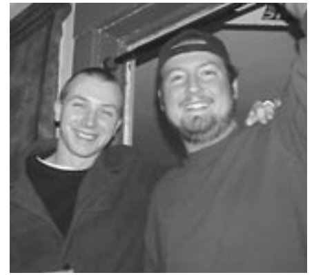
Good times continue at NY Beta.