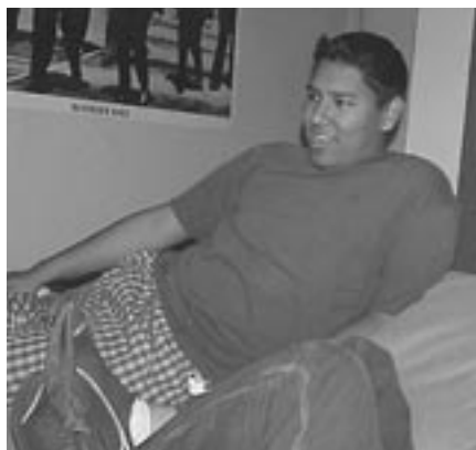
A brother relaxes.

The washer and dryer we have are pretty obsolete from 15 years ago (if they're not older). I am doing research now on the type of dryer we need. There is so much more to do, but these projects give you an idea of some of what needs to be done.