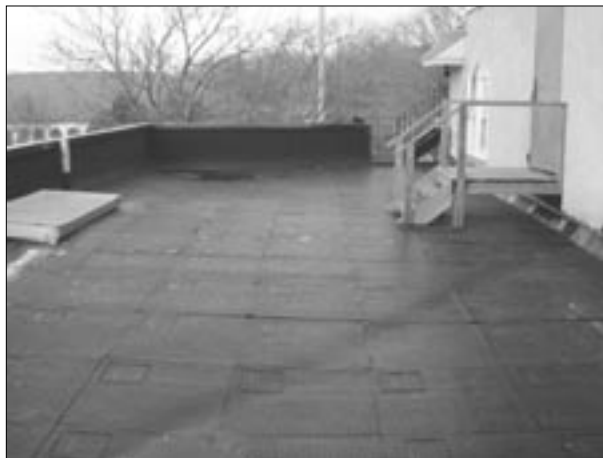
The porch has been resurfaced with a durable all-weather, all-activities material.

The drop ceilings in the living room and pool room were removed, and new dry-