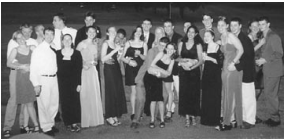
Brothers and their dates at a formal.