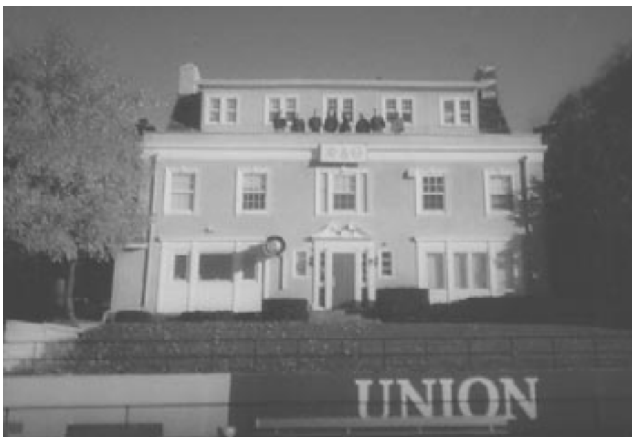
Our house still stands proudly.