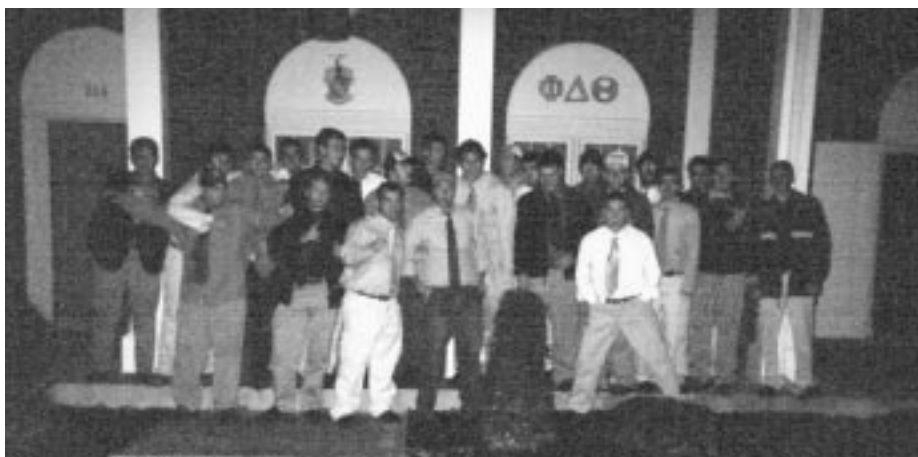
Phikeias in front of Colgate's chapter house.

"I will strive in all ways to transmit the fraternity to those who follow after, not only not less, but greater than it was transmitted to me."