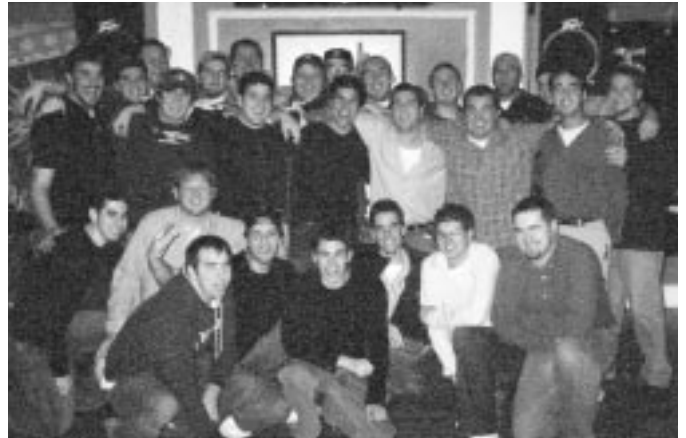
The brotherhood with the new brothers.